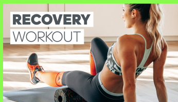
20-minute Foam Rolling Routine