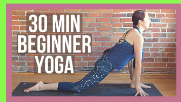
30-minute Easy Yoga