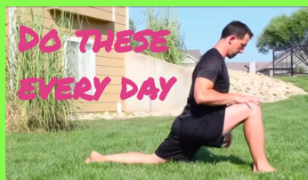
8-minute Hip Mobility Sequence