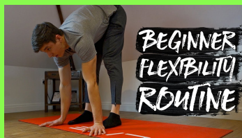
15-minute Full Body Stretch